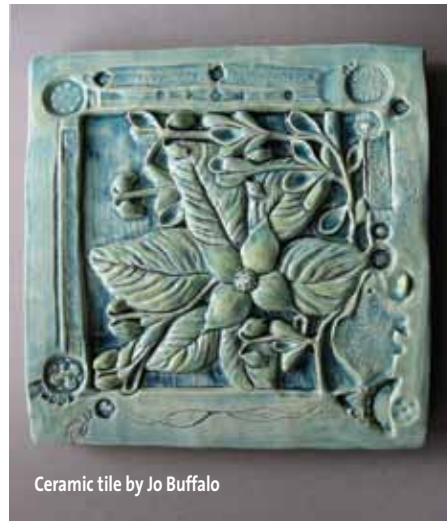
Ceramic tile by Jo Buffalo

I was a James Renwick Fellow in 1997 and initially thought I would write about ceramics for a general audience. I did a huge amount of research about ceramic plates. I found plates and plate-like objects in most of the museums of the Smithsonian. In each museum the