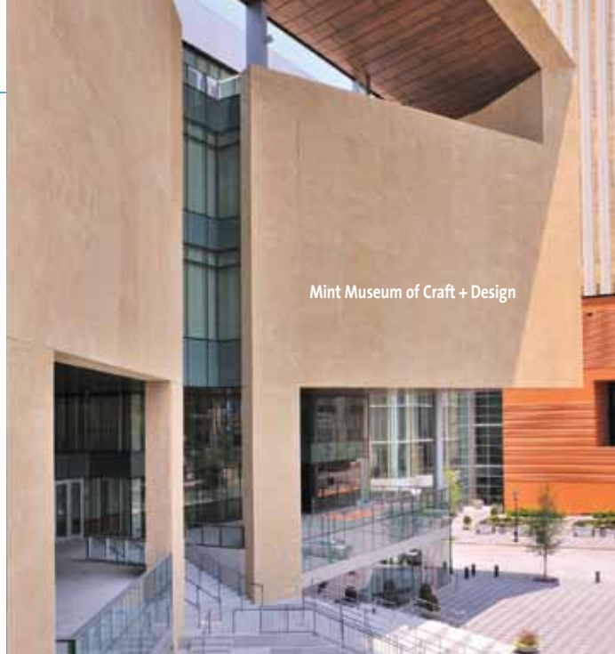
Mint Museum of Craft + Design