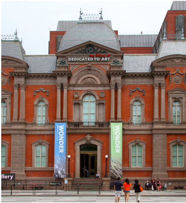
The Renwick Gallery

See a full listing of museums and cultural institutions at www.washington.org