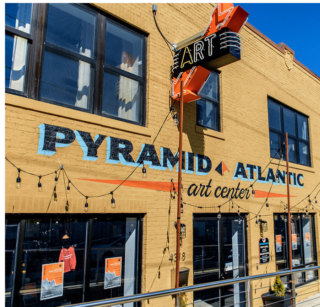
Pyramid Atlantic Arts Center in Hyattsville, MD

Glen Echo Park is an arts and cultural center located in Glen Echo, Maryland that, in its former incarnation, was a popular Washington, D.C.-area amusement park that operated for several decades from the early 1900s to the 1960s.