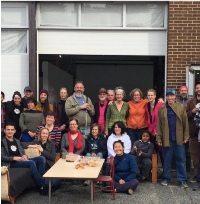
Red Dirt Studio in Mt. Rainier, MD