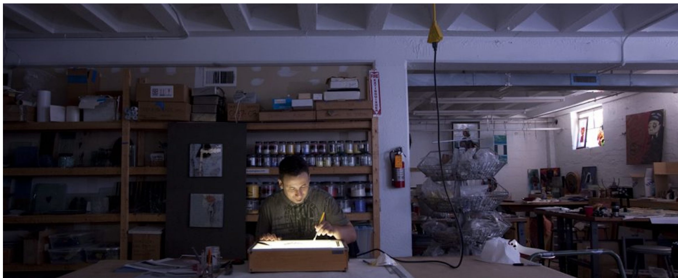
Washington Glass School & Studio