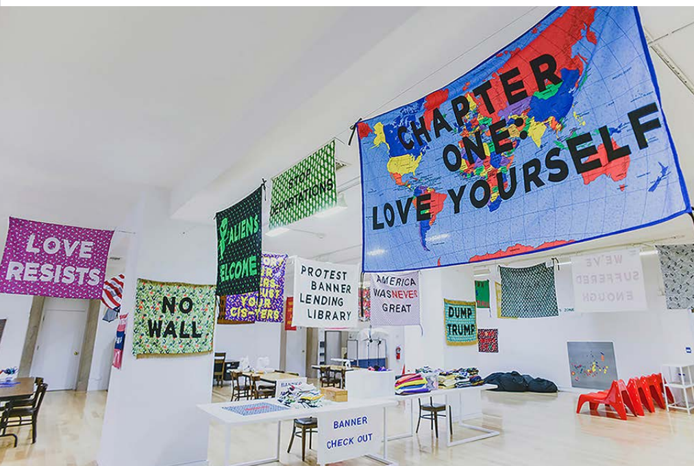
Protest Banner Lending Library, 2016 – present. Installation: Chicago Cultural Center.

By telling our own stories, we claim space. We become visible. Representation is: “I see you. I am you. You are not alone. You are important. We are proud.” There is something profoundly powerful about seeing the many nuances and complexities of your story and your experiences reflected back to you; it’s a sigh of momentary relief. Then we fight for more. Pushing Back: Talking Back to