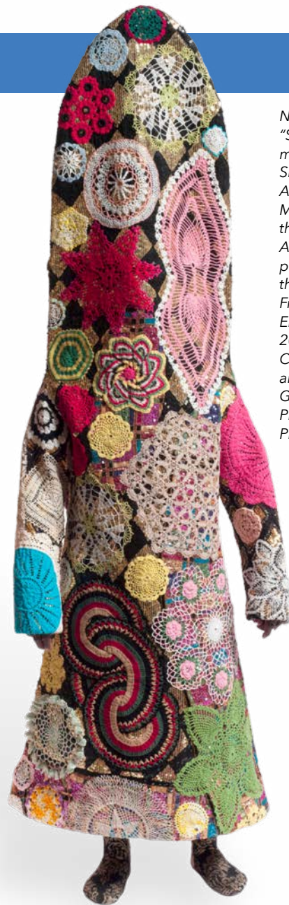
Nick Cave, "Soundsuit," 2009, mixed media. Smithsonian American Art Museum, Gift of the James Renwick Alliance and museum purchase through the Luisita L. and Franz H. Denghausen Endowment. © 2009, Nick Cave.

Those events were just a preview of what was to come. Over the last 40 years, we have worked to fulfill our mission to celebrate and advance American craft through public programs, educational trips, publications, and recognition of excellence in craft.