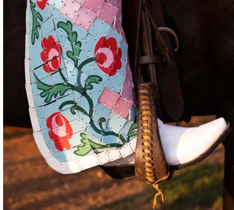
Shae Bishop "Eternal Cowboy" and "Eternal Cowboy" (detail).

to think about along with the use of florals in Western wear, from Indian decorative techniques in beadware, to Hollywood creating a larger than life aesthetic on the silver screen. In my fragile masculinity series, there was a thread of ideas around the form of the cowboy hat which has a lot to do with the archetype of masculinity. The piece, You Looking at Me 'Pardner (two men nearly nose to nose in double cowboy hats) holds the body in a different relationship for two masculine entities. I'm interested in gender and exceptions where culture bleeds into things we think are traditionally masculine or feminine. I'm also fascinated by the legendary Ukrainian tailor Nudie Cohn (Nuta Kotlyarenko, famous for Western wear rhinestone studded Nudie suits). His non-traditional garments got everyone excited about wearing glamorous sparkly pink and turquoise pastels, from Hank Snow to Marty Robbins. There are different ways to interpret what is masculine and what is feminine and at times things slip beyond the general norms. Those are interesting to me.