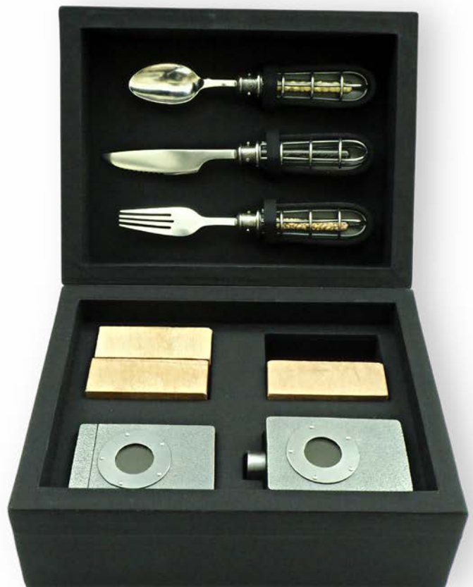
David Harper Clemons, "The Weight of Deferred Gratification," 2019, sterling silver, stainless steel, brass, mahogany, glass, grains. Smithsonian American Art Museum, Renwick Gallery acquisition made possible by JRACraft.

Most particularly among these goals, we aimed to address what we identified as our greatest failing: inclusive representation within our collection and exhibitions. In 2019, an analysis of our collection revealed that we were not living up to our own ideals, with only one-third of the collection by women artists, and scant representation of artists of color, so we set out to make a change. Now, as we reach the end of a successful campaign, I am pleased to share a few of our successes, reached in no small part by the continued support and dedication of JRACraft and its members, who share many of our goals.